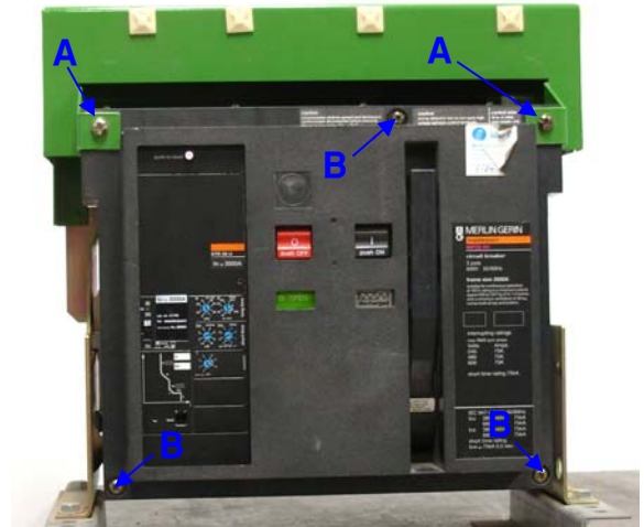
FIGURE 1, FRONT VIEW OF BREAKER